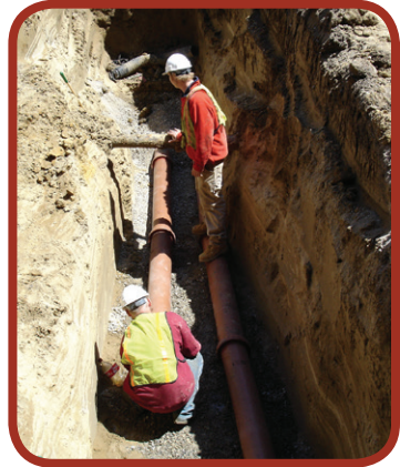
Figure 31: Two services constructed in the same trench excavation

As the installation progresses, the interior of the pipe should be cleared of all dirt and foreign material. The trench should be kept as dry as possible while the pipe is being installed. The specific manufacturer's recommendations should be carefully followed.