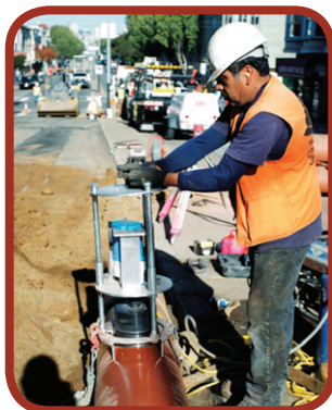
Figure 30: Tapping a new sewer main for a service connection

Where the bottom of the trench is either of rock or an unstable material, it is necessary to excavate below grade and backfill to grade with angular crushed rock or similar material.